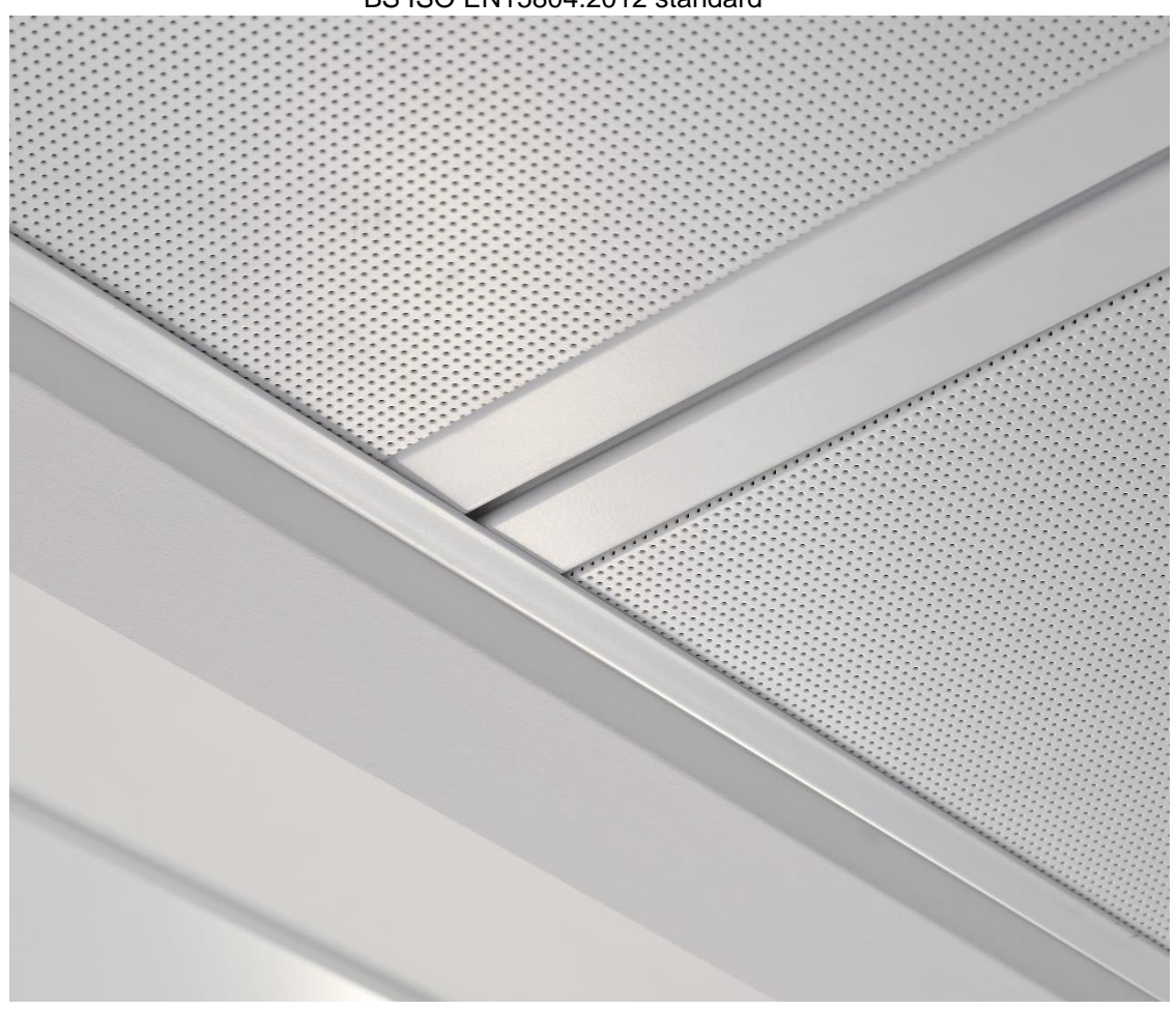
Metal Ceiling System SAS330 Chilled – Aluminium CPC Code 42190

EPDs of construction products may not be comparable if they do not comply with the BS ISO EN15804:2012 standard